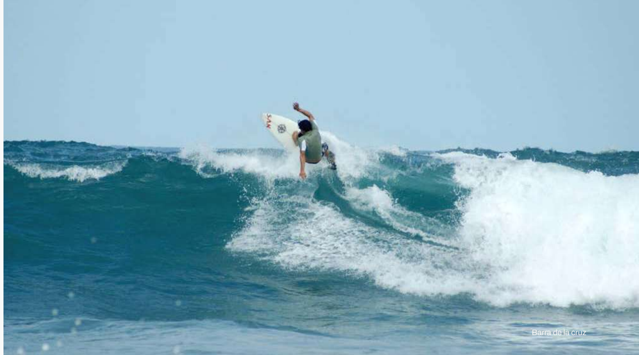
Barra de la cruz